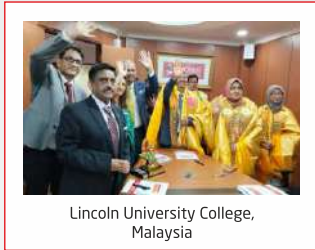
Lincoln University College, Malaysia