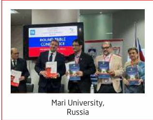
Mari University, Russia