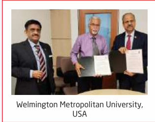
Wilmington Metropolitan University, USA