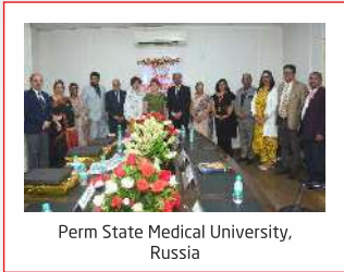
Perm State Medical University, Russia